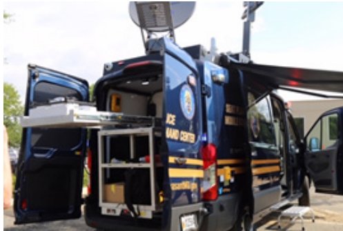
SPPD Mobile Command Center equipped with smart technologies.

of our residents during the time of an emergency,” Seat Pleasant Police Chief said.