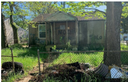
Property, 420 69 th Place, will become the City's 8 th smart home.

We thank you for your patience and look forward to many more opportunities to serve you.