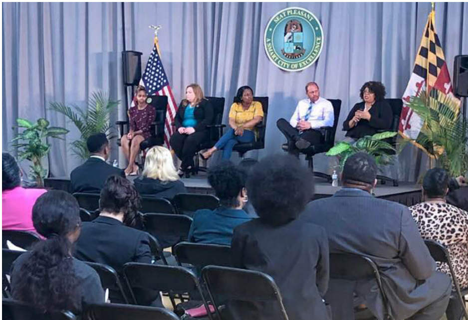
Panelists speaking to attendees at Seat Pleasant's 2nd annual Minority Business Day on how to obtain a Minority Business Enterprise Certification (MBE).