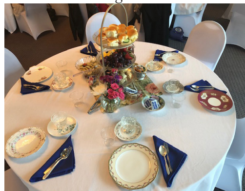
Beautifully decorated table at Mayor Grant's annual mother's day tea brunch.

band of students play musical selections during the Tea.