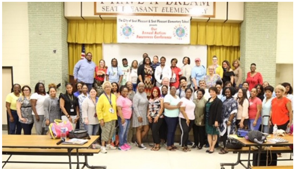
Seat Pleasant Elementary School Staff pose for a picture during National Teacher Appreciation Week.

Each year, within the second week of May people show their thanks and gratitude to stellar educators. During that week teachers are given freebies or discounts from some of their favorite stores or restaurants. Thank you, teachers, for all that you do to help our children reach for the stars. Thank you Seat Pleasant